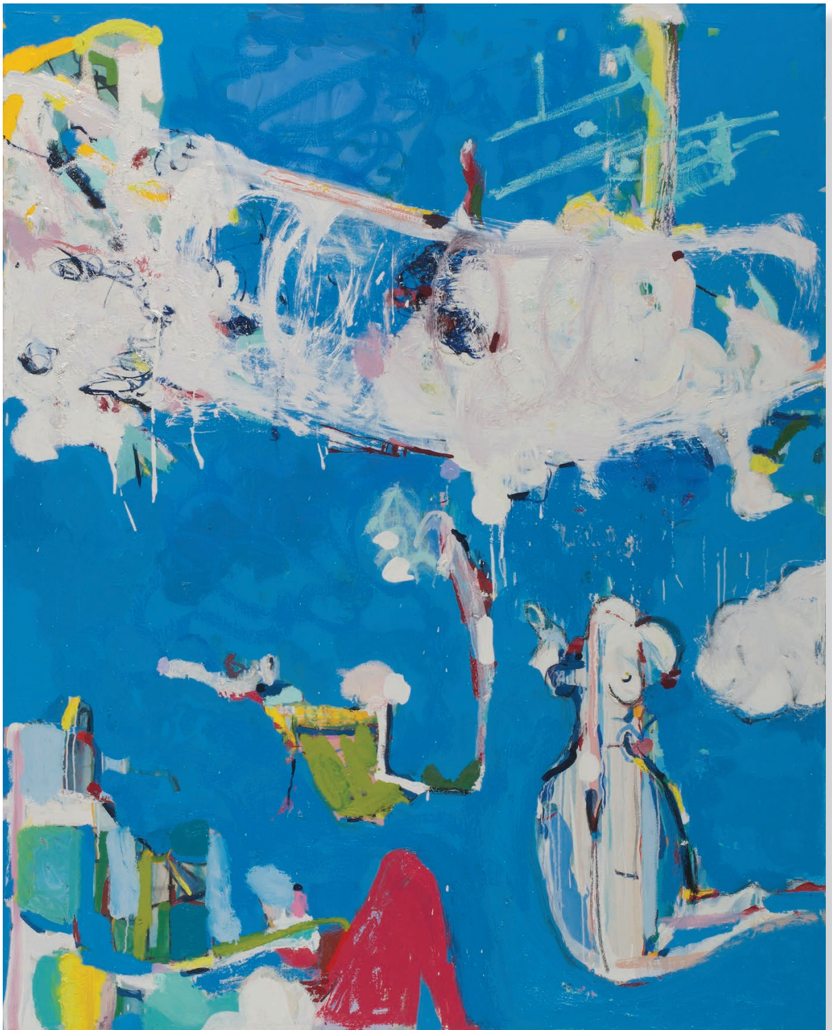
Yummy Dream oil/linen 60 x 48 inches 138518