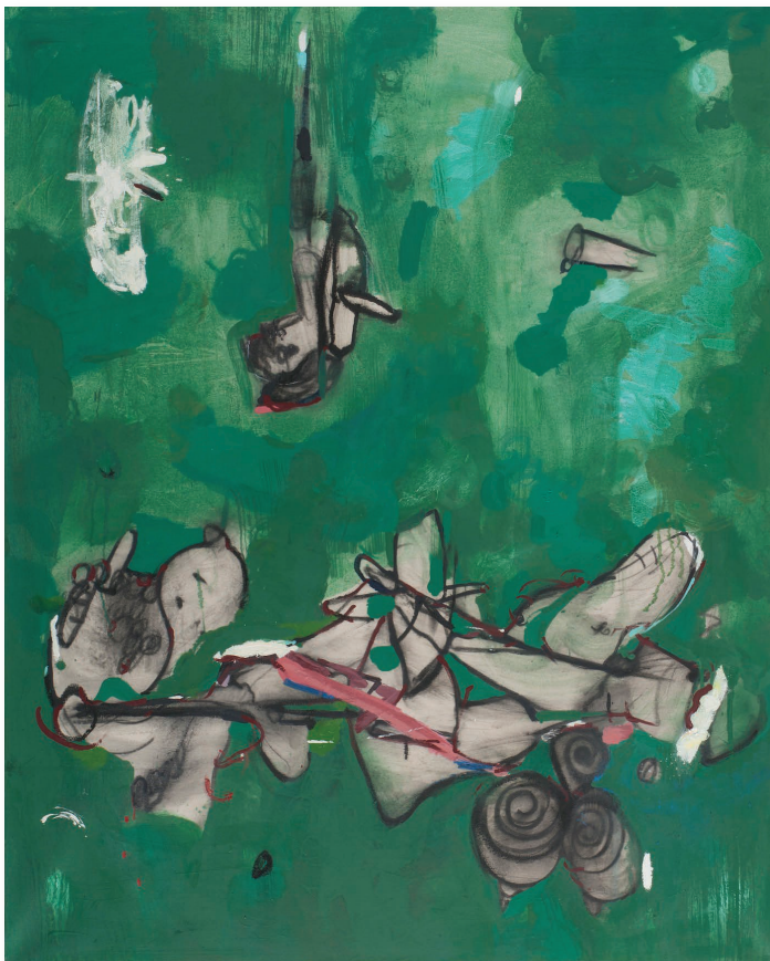
Medicine Dance oil/linen 60 x 48 inches 138497