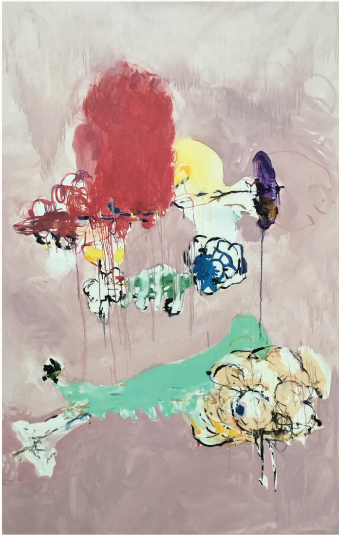
Float oil/linen 80 x 56 inches 138494