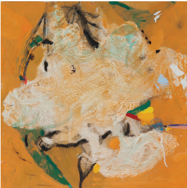
Southwest Vegetation oil/linen 24 x 24 inches 138512