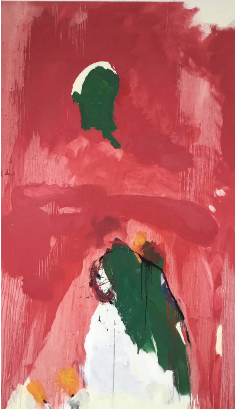
Hike Among oil/linen 80 x 56 inches 138505