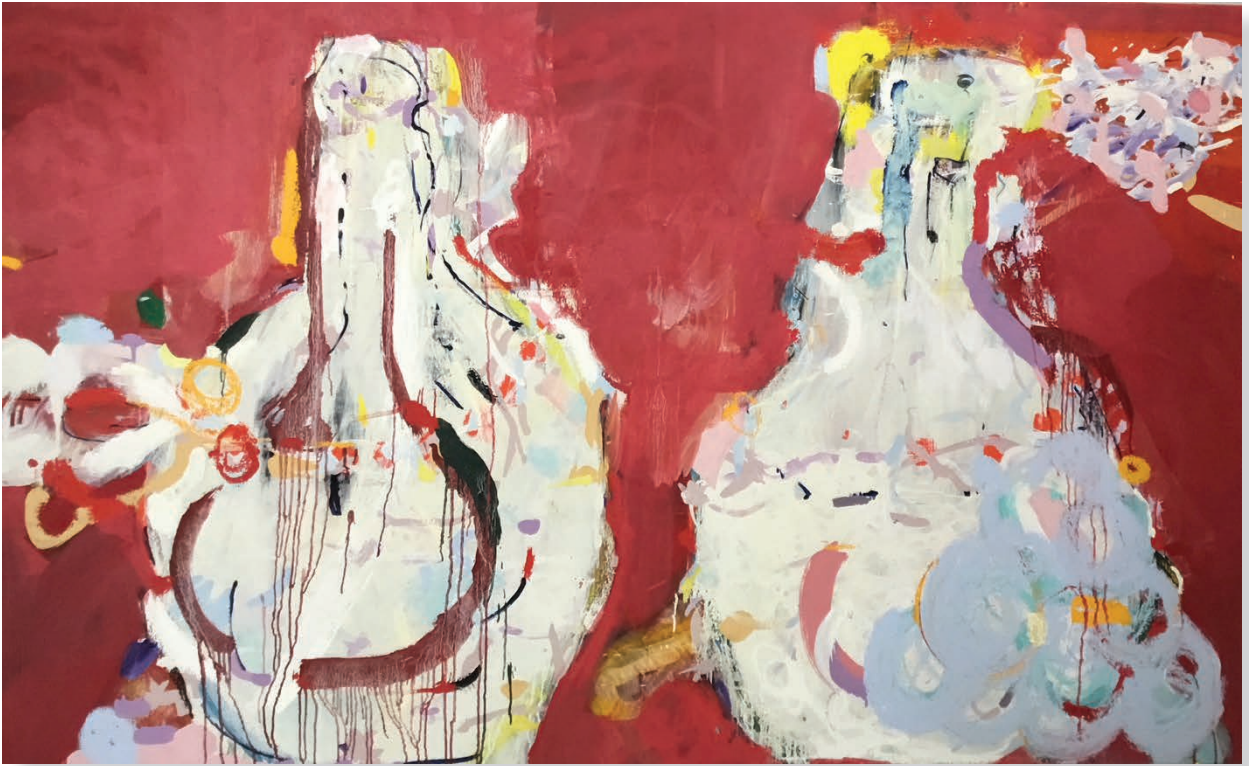
Two Vessels oil/linen 48 x 80 inches 138516