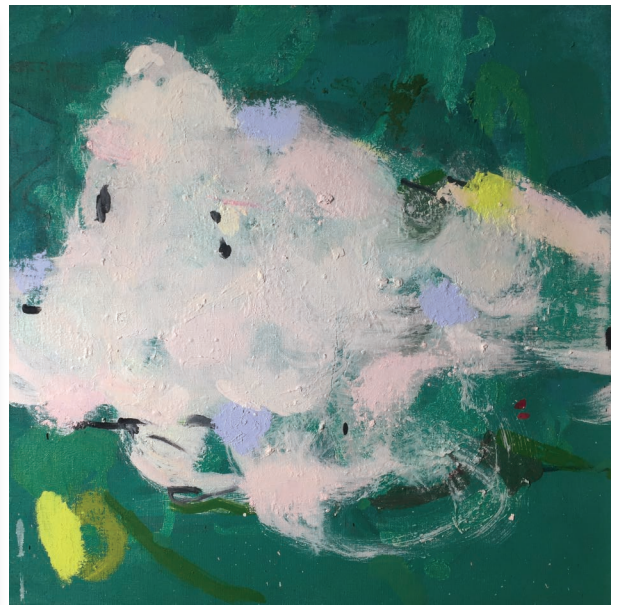
Northeastern Pines oil/wood 24 x 24 inches 138513