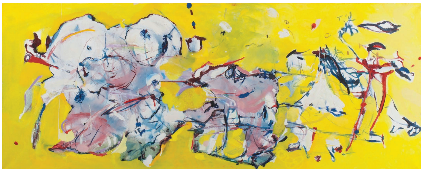
Visitar el Jardin oil/linen 32 x 80 inches 138517