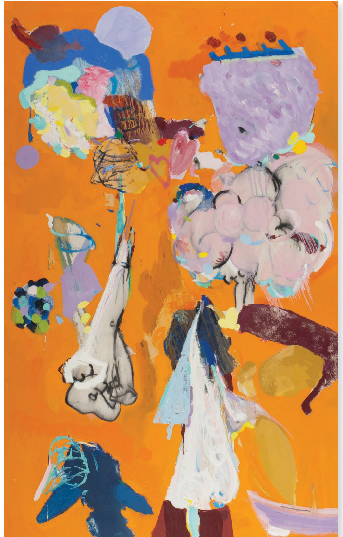
Iconic Heart oil/linen 76 x 48 inches 138495