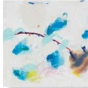
Love to Play oil/wood 8 x 8 inches 138509