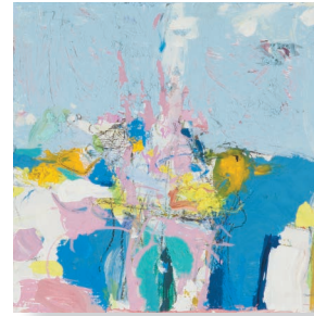
Lovely Vista oil/wood 8 x 8 inches 138510