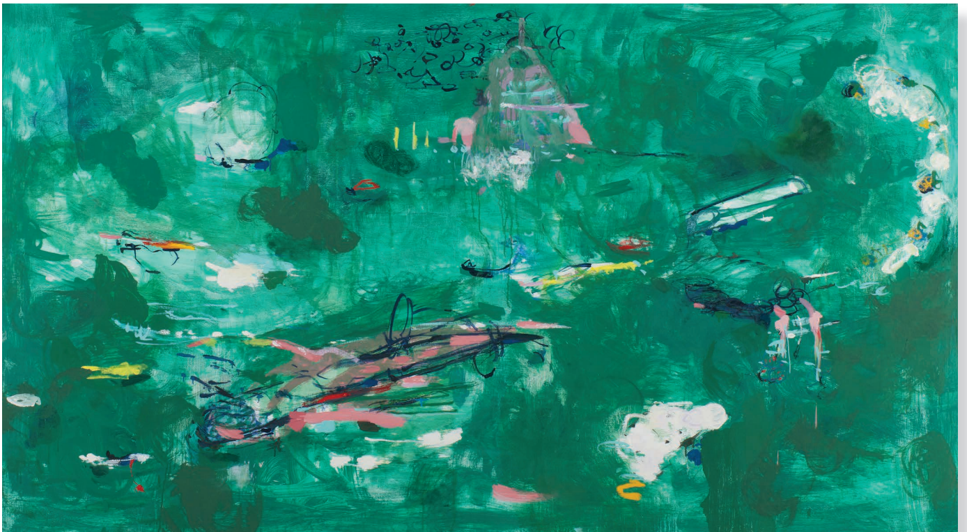
Shadow Dream oil/linen 50 x 90 inches 138511