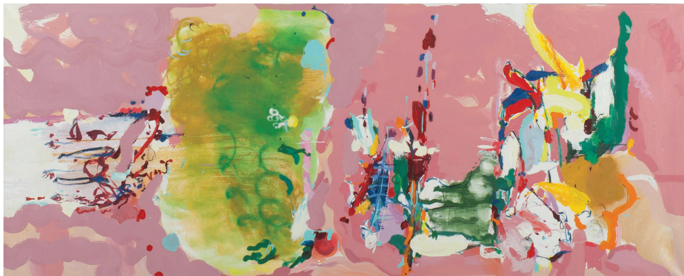
Cameo oil/linen 32 x 80 inches 138504

I make art to make sense of this world in which we live. A heavy black charcoal mark on rich white paper is breaking silence. Making marks is a beginning to identity.