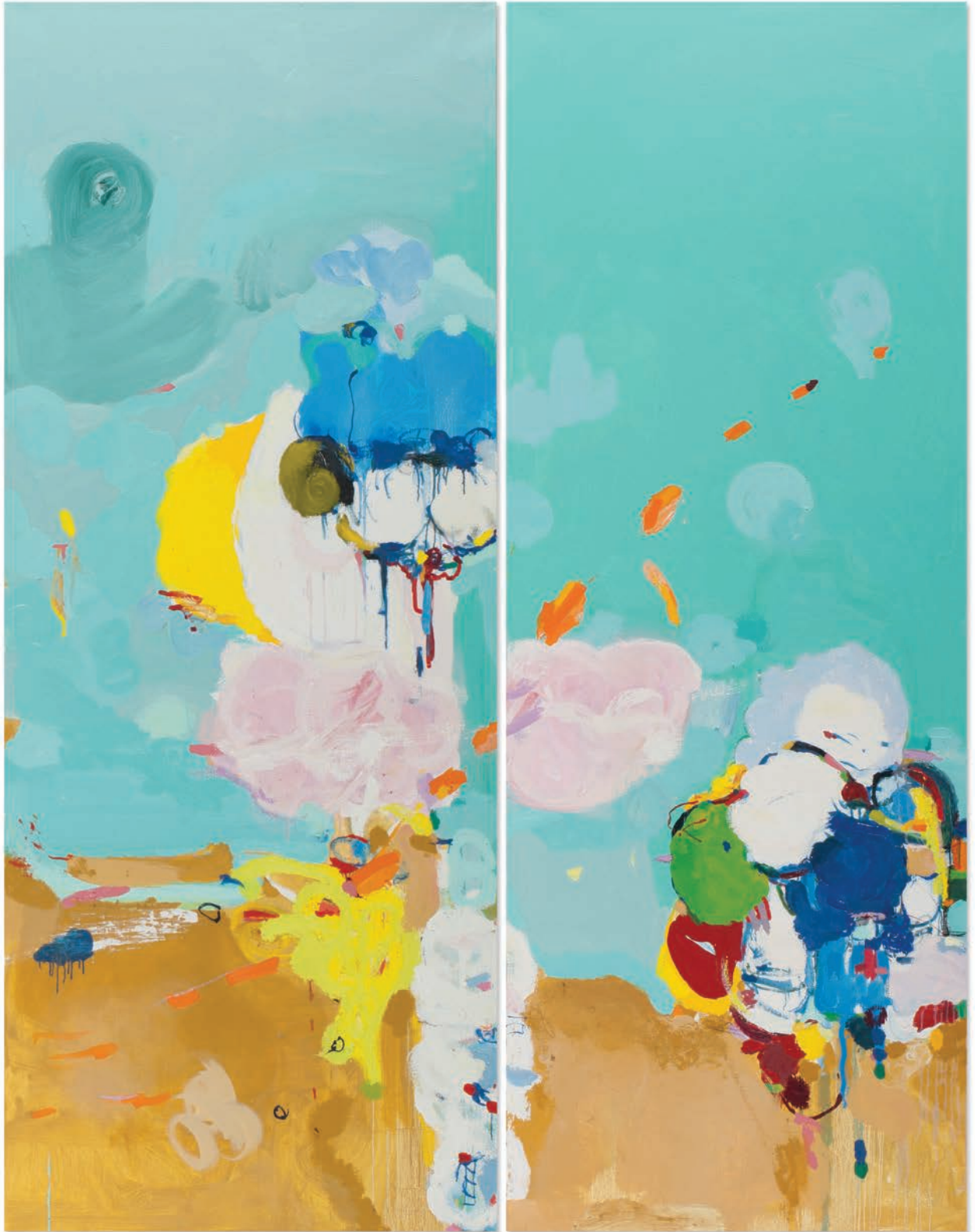
Riding on a Cloud • oil/linen • 80 x 64 inches • 138498 (Diptych)