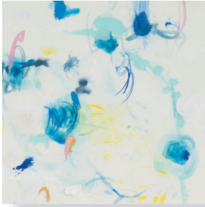
Love to Play 2 oil/wood 8 x 8 inches 138508