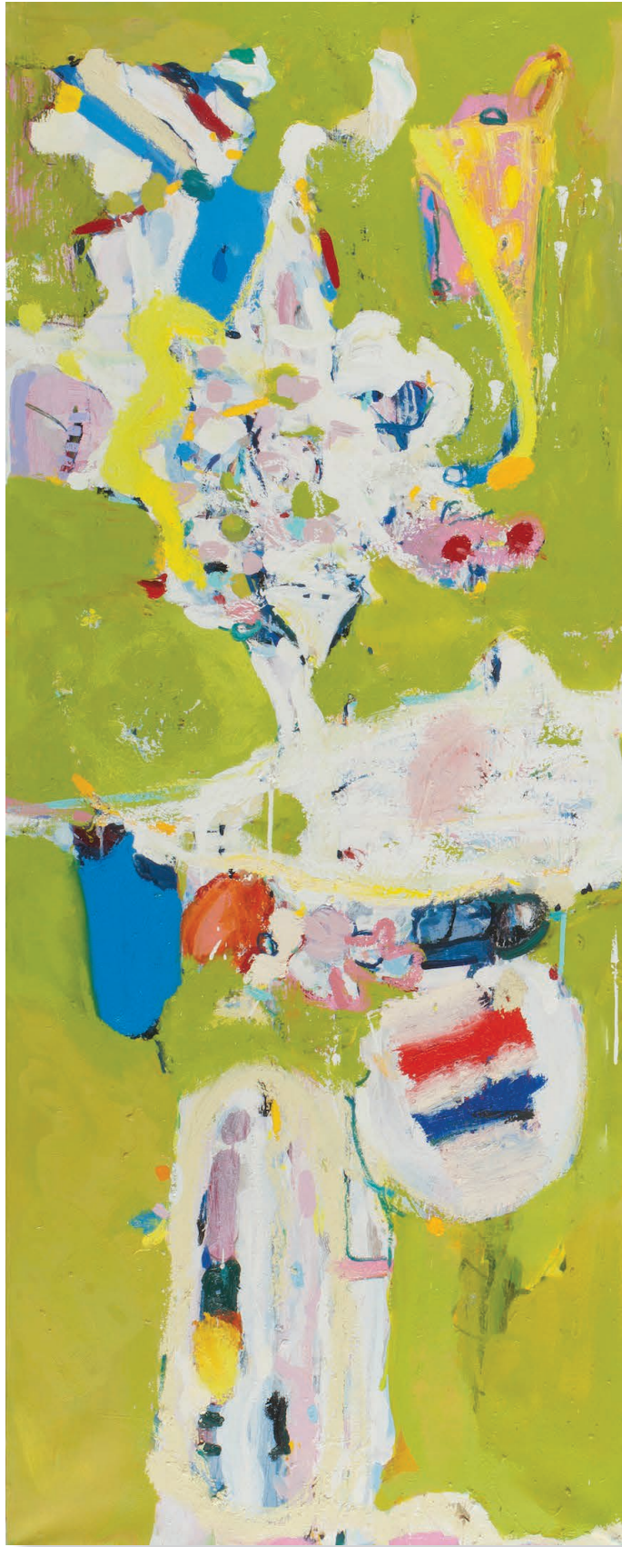
ATTENTION! oil/linen 80 x 32 inches 138502