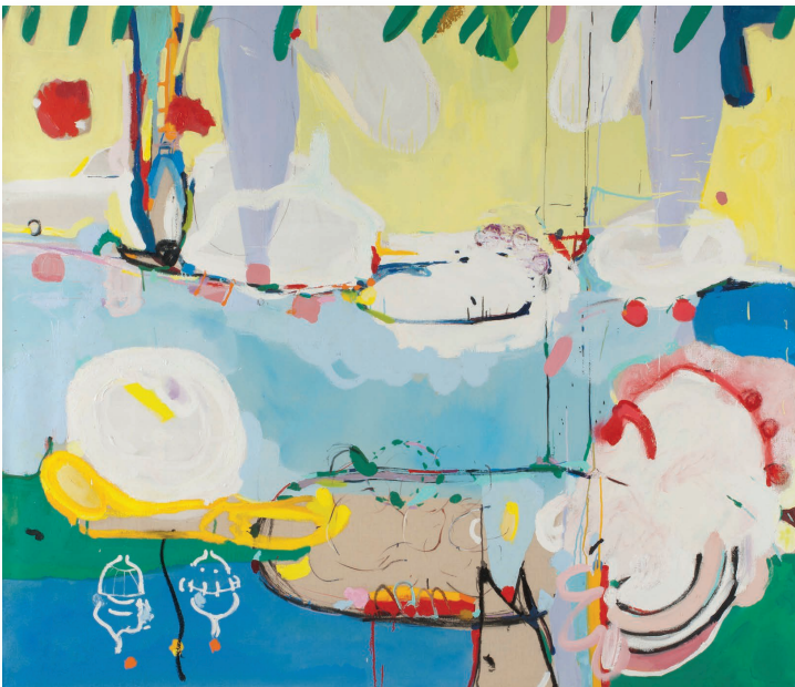
Wetlands oil/linen 68 x 80 inches 138500 Cover (Detail)