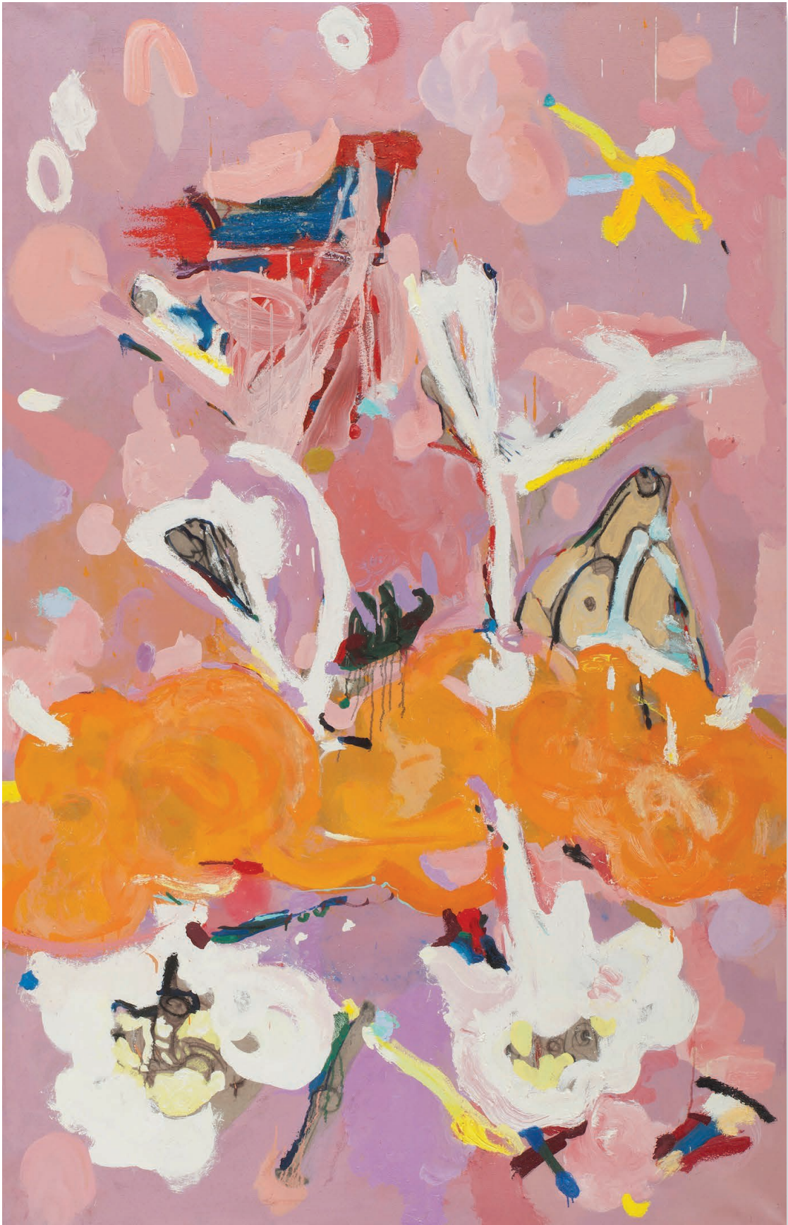
Bare Bones • oil/linen • 78 x 50 inches • 138503