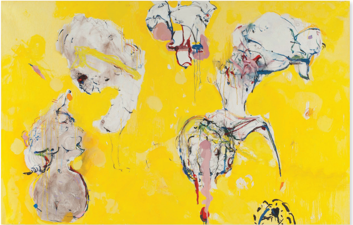
Share the Light oil/linen 50 x 78 inches 138499