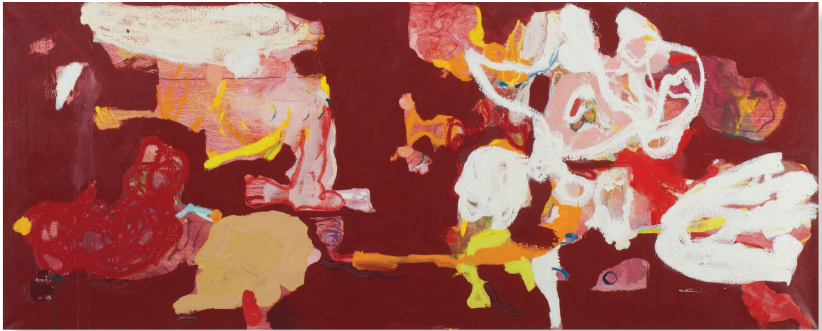
Just So oil/linen 32 x 80 inches 138506