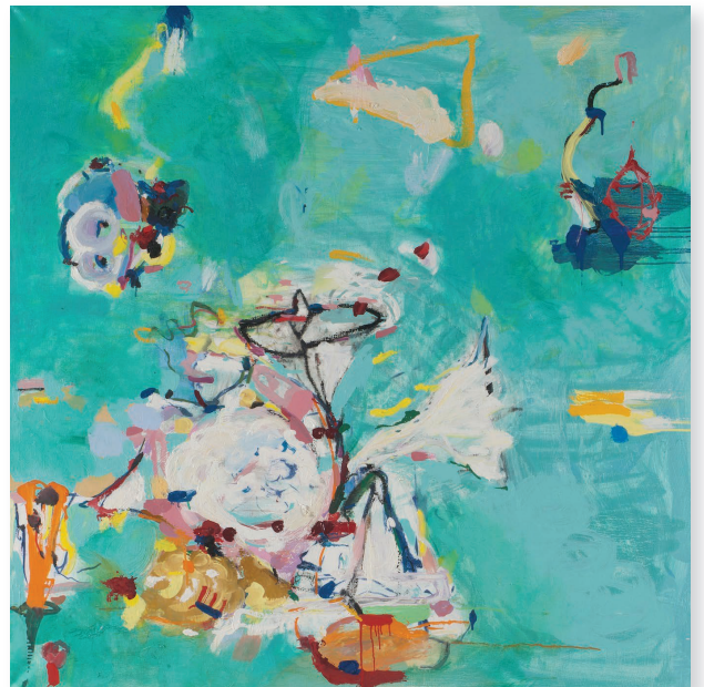
Love on a Mountain oil/linen 48 x 48 inches 138496